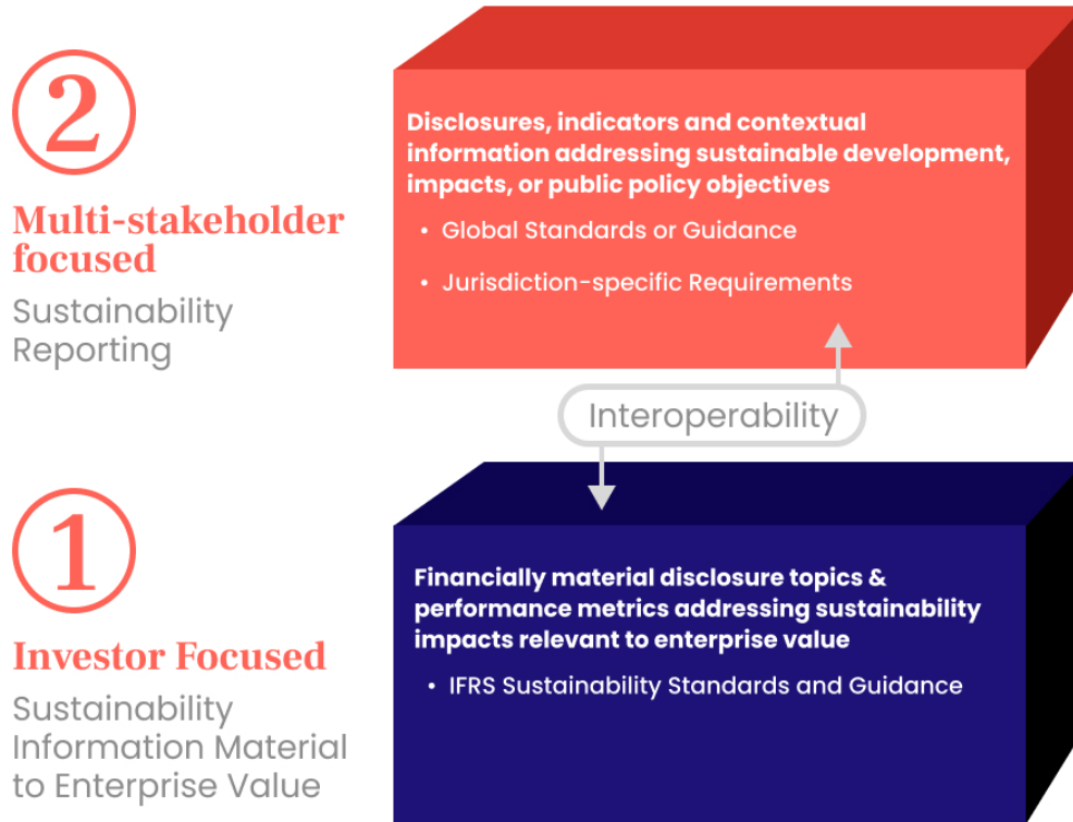
Figure 3. IFAC Building Block Approach to Sustainability Reporting