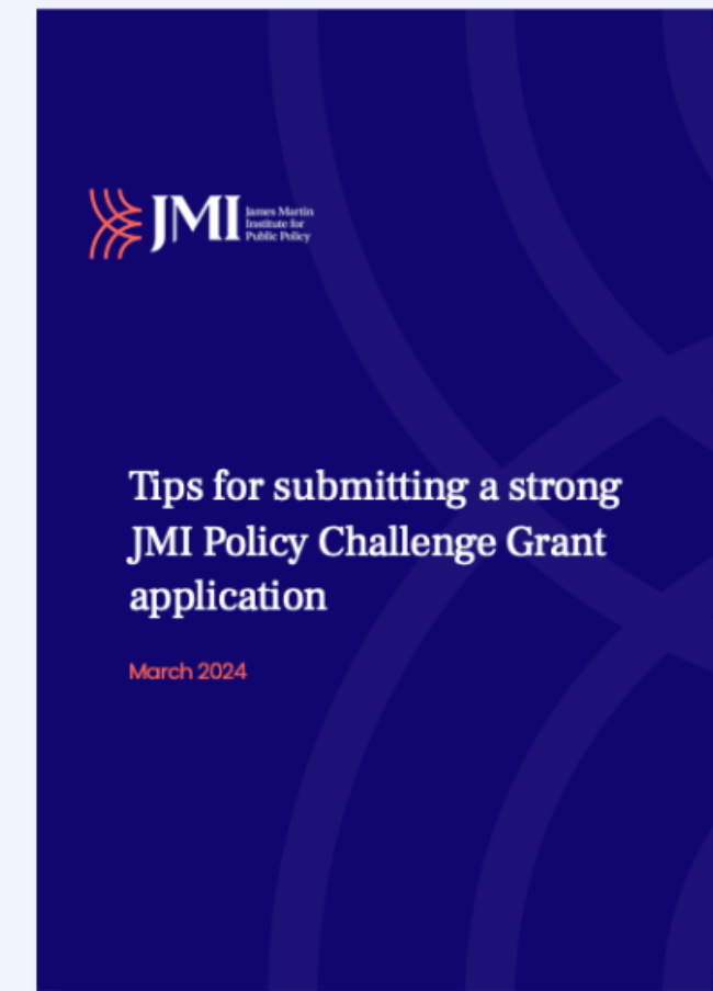
Tips for submitting a strong JMI Policy Challenge Grant application